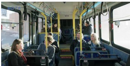
Image showing inside of bus, seating and standing options.

Note: If you need more than one bus to get where you need to go, ask the bus driver for a “transfer card” when entering the bus. A transfer card is free and good for one hour. You will not need to pay more money when you switch onto your second bus.