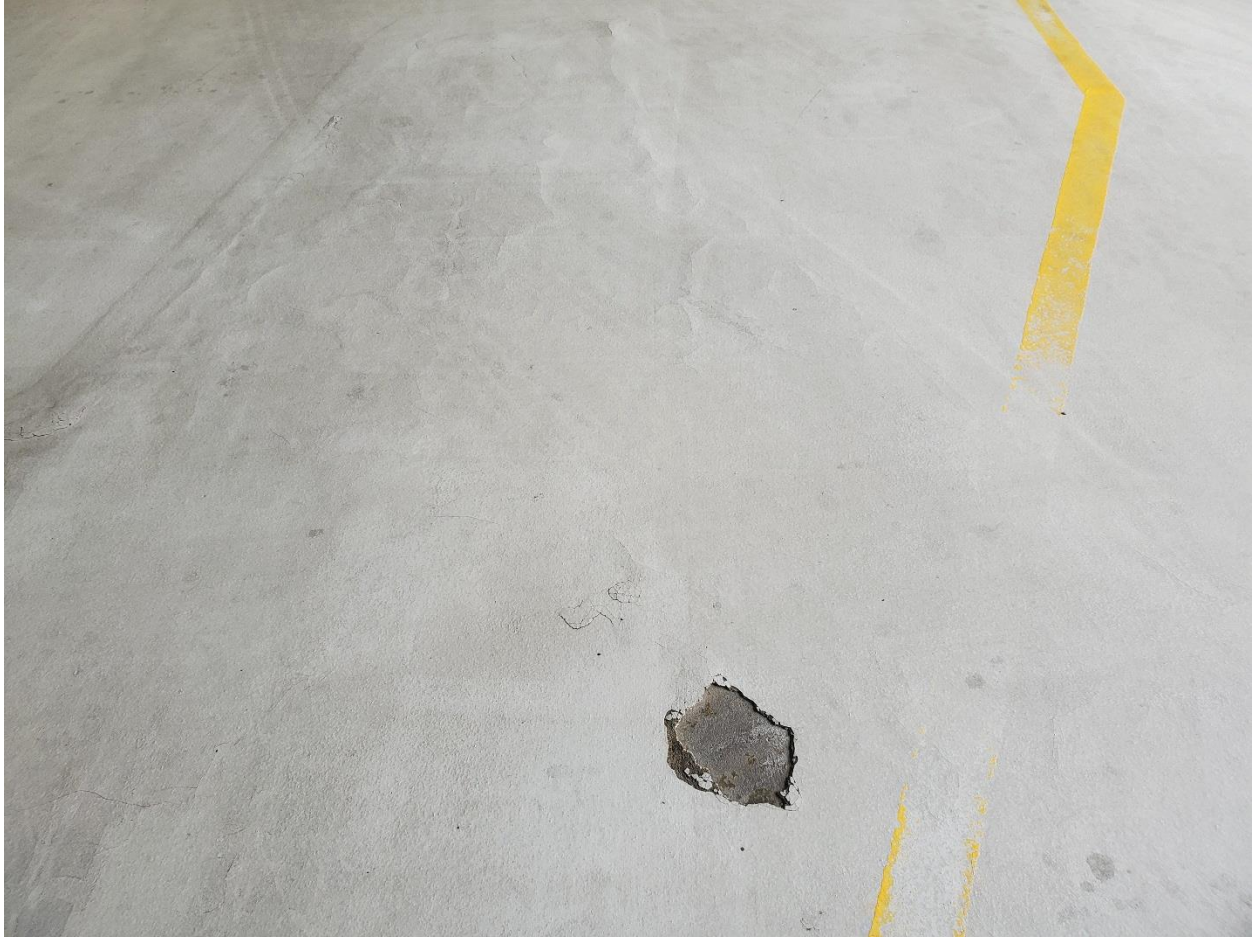
Area to be recoated at the bus entrance area