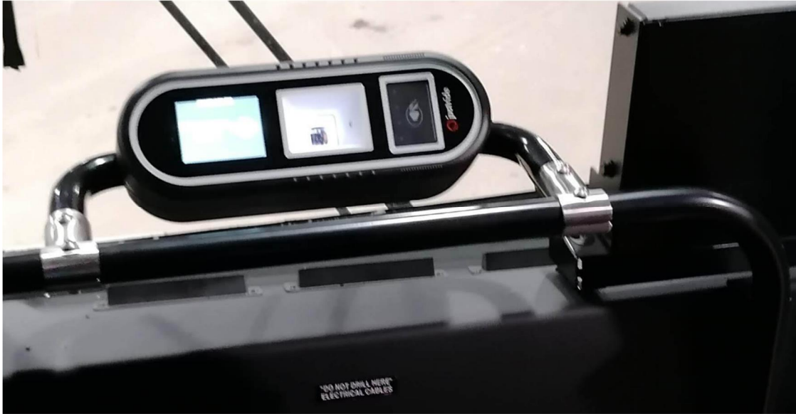
Exhibit A Picture of Installed Validator.